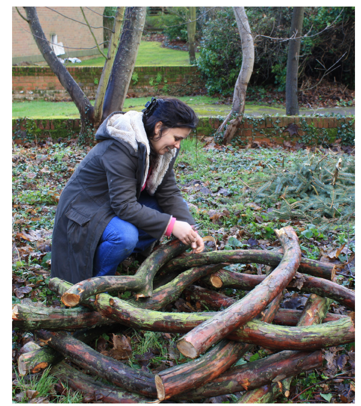
Let plants go wild