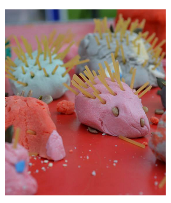
Spread the word