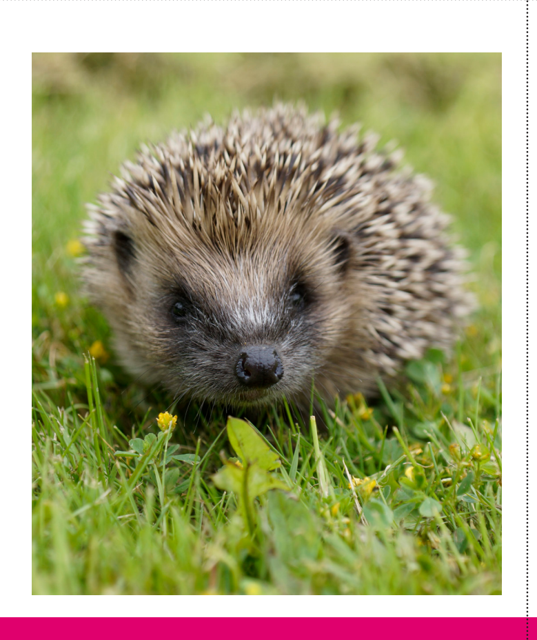
Stop using chemicals