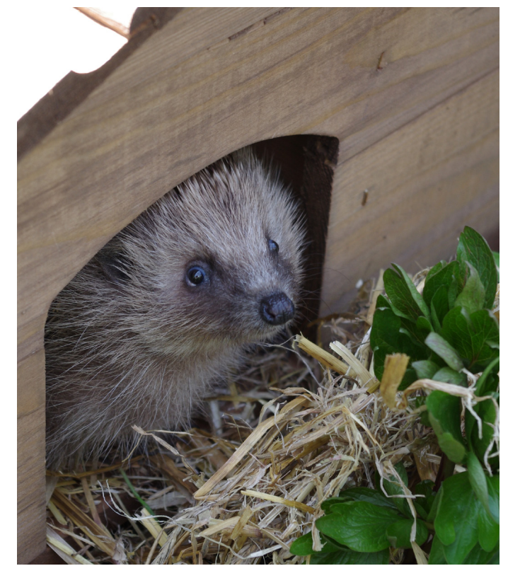
Link your garden